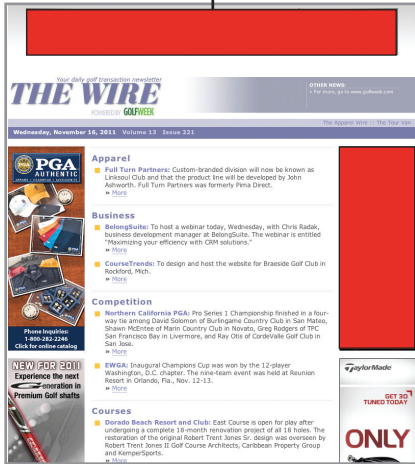
Side Banner 150 x 400